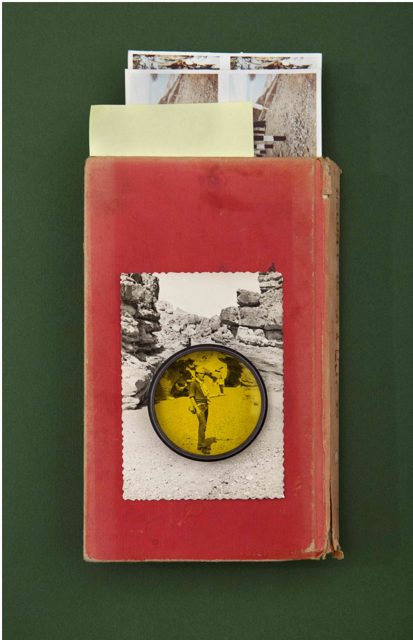
Dor Guez, Sick Man of Europe Archival Material, 2014.

Since 2004, Artis has been organizing research trips allowing curators and gallerists from the United States and Europe to visit their counterparts in Israel and visit Israeli artists in their studios, while supporting Israeli artists in their exhibitions and residencies in the United States and abroad.