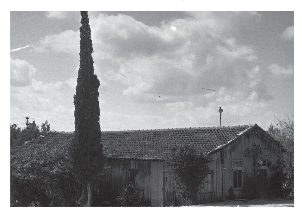
Fig. 5. The hut of the Mishkan Museum of Art, Ein Harod, early 1940s, Ein Harod, photograph.