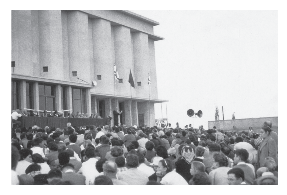
Fig. 2. The inauguration of the new building of the Ghetto Fighters' House Museum, 1958, Israel, photograph.

The Ghetto Fighters' Kibbutz, on the other hand, offers a more successful model in establishing a museum on kibbutz grounds. Yitzhak Cukierman (Antek) (1915–1981) was one of the leaders of the Warsaw Ghetto Uprising, and a friend of Kovner's. Both of them arrived in Palestine in the same period. Only a few years later, in 1949, he was among the founders of both the Ghetto Fighters' Kibbutz and of the institute for Holocaust documentation and commemoration, the Itzhak Katzenelson Holocaust and Jewish Resistance Heritage Museum, which is still known as the Ghetto Fighters' House Museum (fig. 2). The establishment of this museum became possible not only because of the