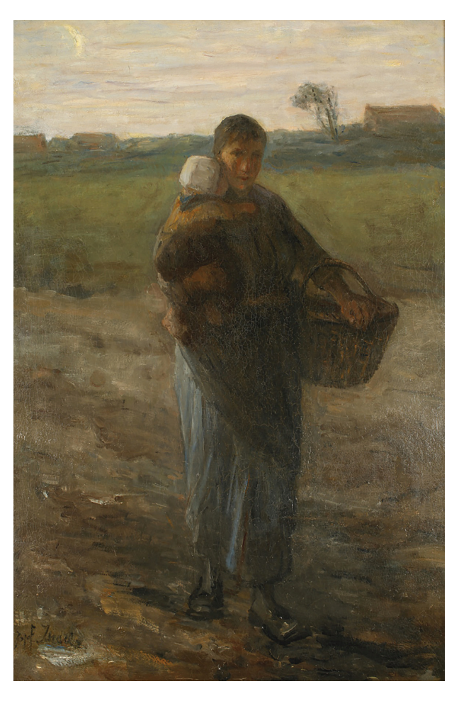
Fig. 7. Jozef Israëls, On the Way , 1885, oil on canvas, 91×61 cm. Collection of Mishkan Museum of Art, Ein Harod.

been preserved by the Jewish communities since the 16th century may be removed from here. ^{22}