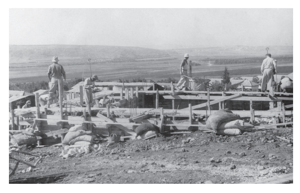
Fig. 6. Laying the foundations for the permanent building of the Mishkan Museum of Art, Ein Harod, 1947, Ein Harod, photograph.