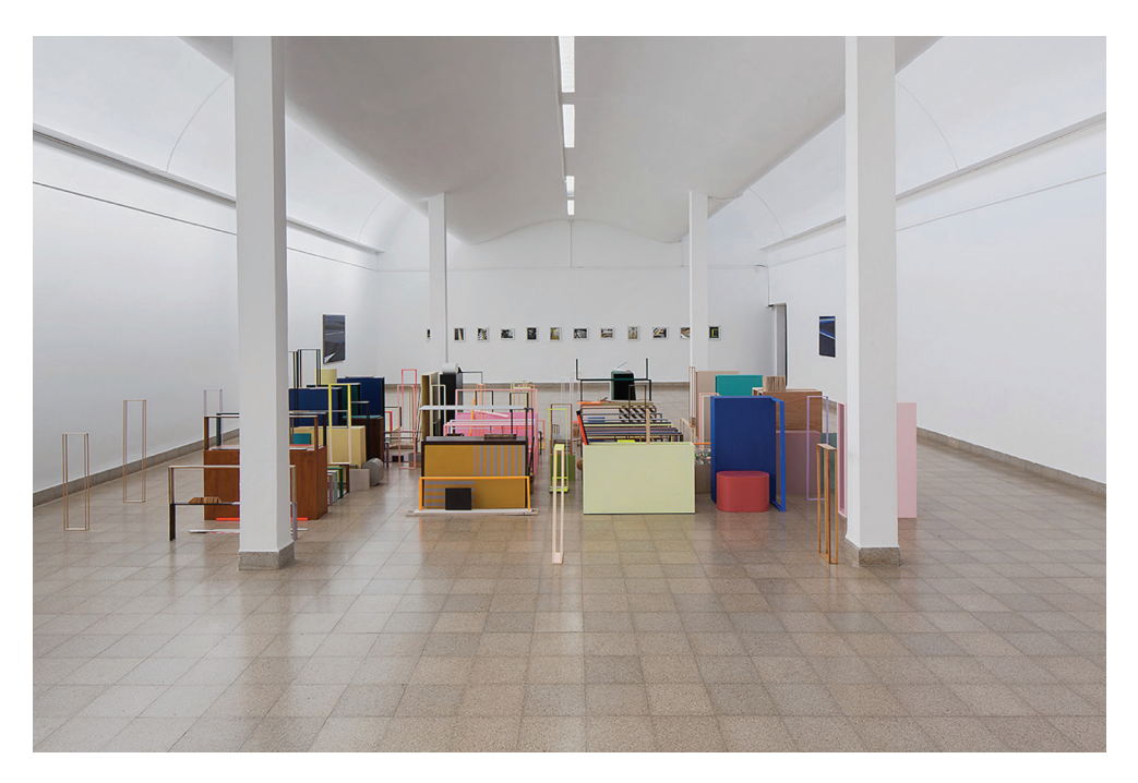
Fig. 3. Elad Sarig, View of a museum gallery, installation: The Rough Law of Garderns: Holzapfel and Tevet , 2016, Mishkan Museum of Art, Ein Harod, Israel, photograph. (Courtesy of the Archive of the Mishkan Museum of Art, Ein Harod).

thought that the establishing of a museum requires the existence of sufficient conditions such as a large population, a concentration of capital, and a social elite's need to define itself as a separate class, as well as the activity of an "obsessed individual."